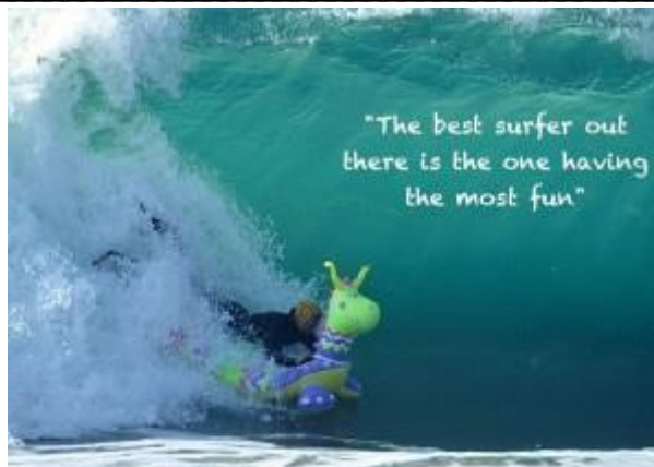
SURFING GOD'S WAVES... ANYONE CAN DO IT...